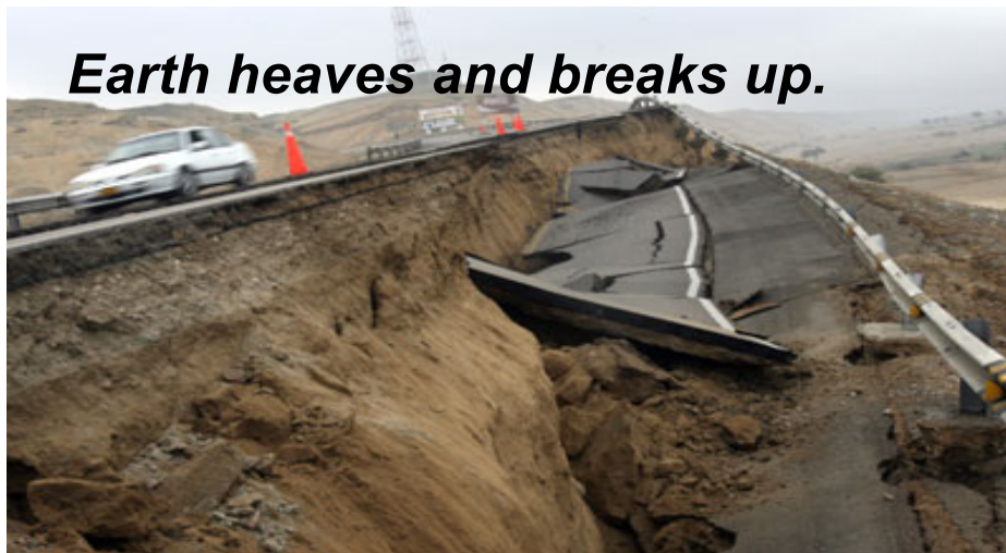
Earth heaves and breaks up.