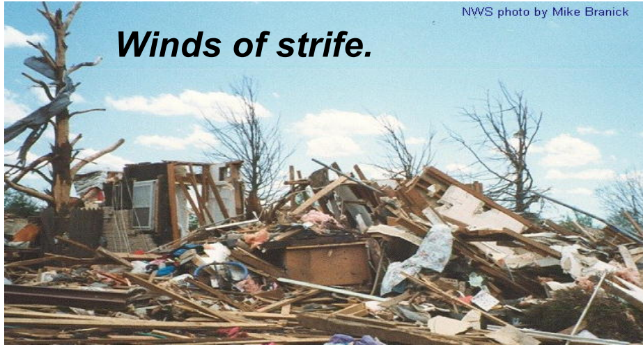
Winds of strife.