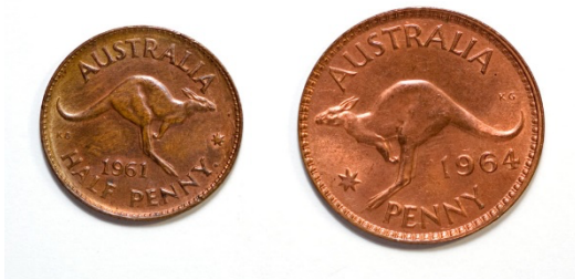
A Half Penny and a Penny

I was born in 1935, and as a boy growing up in North Queensland, I remember people still travelling by horse and sulky. I remember a company called “Hinspeters” in Townsville who started using trucks for carrying services which had hard rubber tyres. We did not have telephones like today, and communications were done mainly by letters by post, with stamps costing “tuppence halfpenny”. (2 ½ pence. Our money then was in pounds shillings and pence!)