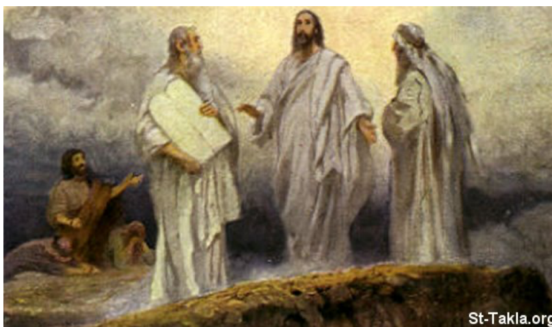
Moses, Jesus and Elijah on the Mount of Transfiguration.

You can also read about Moses and Elijah together appearing with Jesus on the Mount of Transfiguration in Matthew 17:1-8; Mark 9:2-8; Luke 9:28-36 and even Peter speaks about it in 2 Peter 1:16-18.