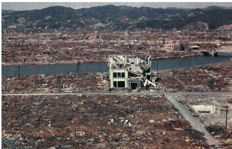
Nuclear damage to Hiroshima and Nagasaki.

JUST IN MY LIFETIME , men have developed nuclear weapons which ended World War 2 when two nuclear bombs were dropped on Hiroshima and Nagasaki. The damage and destruction of life was enormous. Now several powerful nations have arsenals of nuclear weapons even stronger than what was dropped on those Japanese towns in 1945.