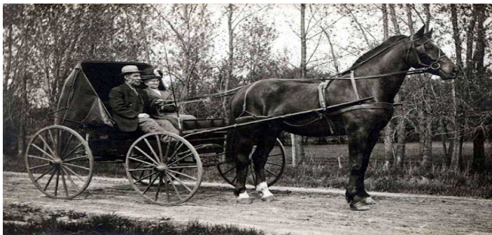
Horse and Sulky.

For nearly 6000 years, we have travelled using animals such as horses, donkeys, camels and reindeer. For nearly 6000 years communications have been by mouth and writings on papyrus scrolls or scratched into stone tablets. For nearly 6000 years we have battled with so many ways to stay well. For nearly 6000 years we have lived in primitive homes made from wood, stone and mud as mortar, and on and on. For nearly 6000 years we have used weapons such as spears, swords, knives and bows and arrows.